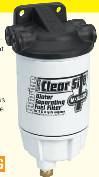
Inboard Part No. 033339-10

*Filter canister will not work with Racor® filter heads